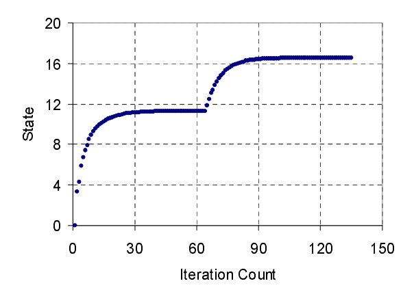
Figure 2: The state of Node 0, which remains connected to the Source after the cut.

We demonstrate the execution of the DSDD algorithm in a network of 24 MicaZ motes, placed on a table in an equally spaced 8x3 grid, as depicted in Figure 1. A multihop network is created by ensuring that nodes communicate only with their immediate neighbors in space. Once the system is started, the DSDD algorithm executes and after about 60 iterations the states of the nodes converge. A laptop is used to display the convergence of the nodes states. Once the states converge, the cut is simulated by physically turning off the motes in the 4^{th} and 5^{th} columns of the 8x3 deployment, as depicted by the section "Cut" in Figure 1). After the cut occurs, the new convergence values for the states are shown on the laptop. Figures 2 and 3 show the evolution of the states of two nodes in the network. As depicted in the figures, at iteration 60 a cut occurs in the network. Node 0 remains connected to the Source node and its state converges to a new value. Node 22 is disconnected from the Source node after the cut occurs and its state converges to