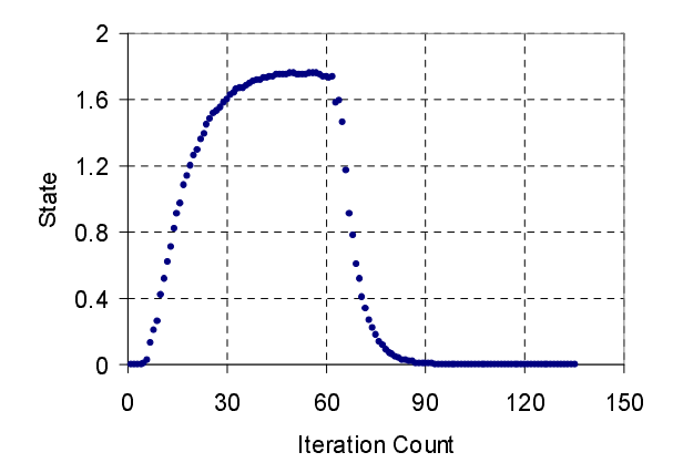
Figure 3: The state of Node 22, which is disconnected from the Source after the cut.

a value of 0. The demonstration also shows the effects of single node failures, when a cut does not occur.