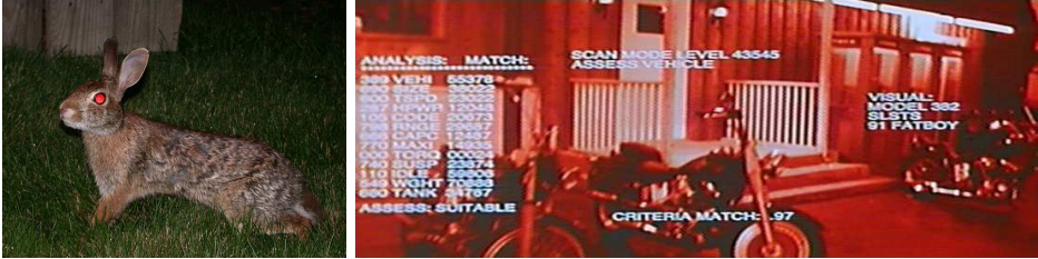
A folk (popular) view of AI

From http://www-2.cs.cmu.edu/afs/cs.cmu.edu/user/zhuxj/www/travel/fun/images/terminator.jpg (top); Universal studio's movie "Terminator" (bottom)