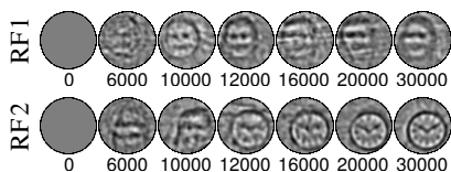
(d) Snapshots of two RFs in the naïve network