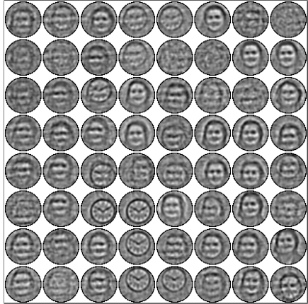
(b) Naïve network (ON-OFF)