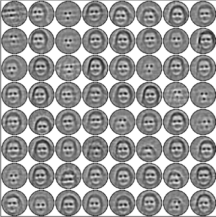
(a) Prenatally trained network (ON-OFF)